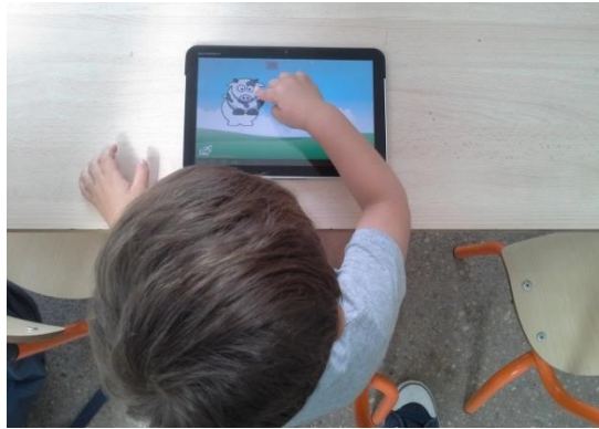
Fig. 2. Pre-kindergarten child performing the drag task.

significantly higher levels of accuracy and, therefore, future multi-touch application for this age range should consider assistive strategies that adapt their behavior to the actual levels of motor and cognitive development of each child. Not doing so, would prevent the more skilled children from exercising and further enhancing their precision related skills at an early phase of their development.