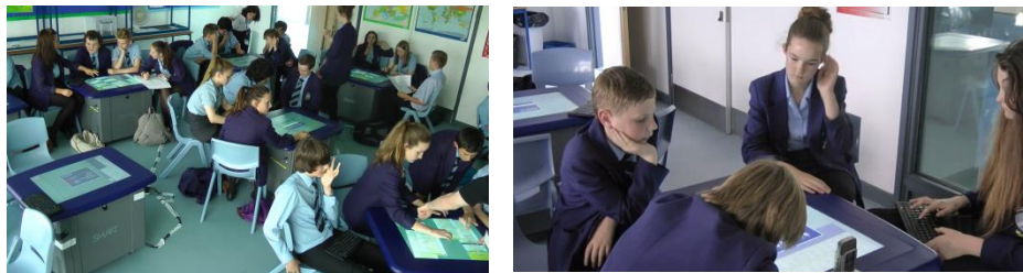
Figure 2: a) Classroom Camera b) Single Group Camera

The study was designed to investigate the relationship between students and the technology through their collaborative behaviours, and that between the teacher and the technology through her feedback and lesson plans. It was conducted over 4 sessions across a half term (6 weeks) in a UK secondary school classroom. The classroom was equipped with 8 smart tables, allowing 8 groups of 3-4 students to participate – 30 students in total. The students were native English speakers of mixed ability, studying English in Year 8 (aged 13-14, key stage 3). Each lesson was planned and facilitated by the class's usual English teacher, who also produced the session content. Sessions were scheduled to fit in with the existing timetable. The teacher met with the research team to discuss and improve the design before the study and had completed a collaborative writing task using CCW. She designed lesson plans to incorporate the technology into her teaching goals. 2-3 Researchers were present at each session, and sessions were filmed with a classroom camera and a single group camera (Figure 2). Before each CCW session, the students completed a collaborative exercise, either Digital Mysteries [10] (first 3 sessions) or a classroom debate (final session). The “in the wild” context also had significant practical ramifications, including: