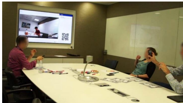
Fig. 2. Room set-up for the study

A session consisted of an introduction to the task and system, a 20 minute collaborative design session, followed by a 20 minute group interview. The task chosen for the design session was for participants to collaborate on a t-shirt design representing the company they work for. The task was chosen to encourage several participants to create, share and discuss both physical and digital artefacts. Participants were divided across 2 conference rooms with 3 collocated people in one room and a single person in the other. This configuration was chosen as we found the 2x2 configuration option to be limiting for exploring aspects of collocated interaction. As such we chose 3 people at one end to better represent these concerns in each session.