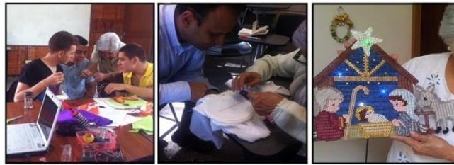
Fig. 2. E-embroidery workshop: using embroidery and electronic materials like conductive thread, we embroidered a crafted Christmas manger with illumination and interactivity.