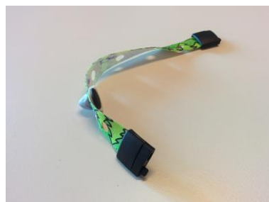
Fig. 2. Original prototype bracelet with an NFC tag embedded in a widget

With the NFC tags suitably housed the next step was to create a means to turn this individual item into a playlist. A simple bracelet was chosen as shown in Fig. 2 below, as each widget could then be customized to produce something akin to a charm bracelet.