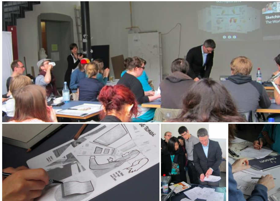
Fig. 1. Activities from previous sketching tutorials and workshops (from top-left to bottom-right): live sketching demonstrations, learning photo tracing, participant's sketch of interactive system, sharing and discussing participants sketches, an rapidly sketching wireframes.

This tutorial is open for everyone and does not require any previous drawing expertise. We will provide sketching materials, but please feel free to bring your own sketches to share, sketchbooks, pens or paper.