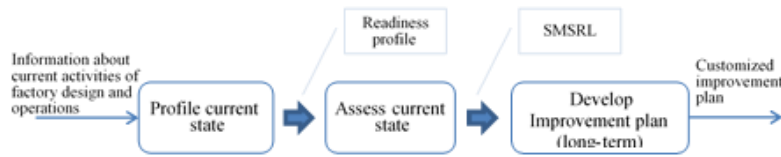
Fig. 1. Overall assessment framework

Erro! Fonte de referência não encontrada. provides an overall architecture of the readiness level assessment. It summarizes the steps, the inputs, and the outputs involved in the assessment followed by improvement plan development. The process is iterated after the plan has been implemented. The primary purpose of the proposed assessment based on the SMSRL index is to 1) help manufacturers determine their current level and 2) develop a customized improvement plan.