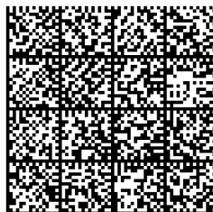
Fig. 3. Example of a two-dimensional code (2D) of the DataMatrix [12]