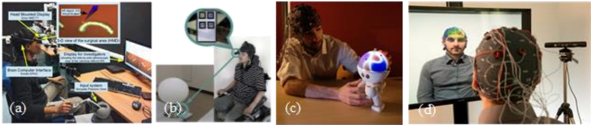
Figure 2: examples of applications combining AR and BCIs (a) Surgeon laser microsurgery training [6]; (b) Home automation system to control a lamp using P300 [36]; (c) TEEGI, brain activity visualization puppet [18] (d) MindMirror: brain activity visualization [30].

environment to allow disabled people to safely learn how to drive a wheelchair. Among different modalities to drive the wheelchair, they designed an SSVEP-based solution to control the direction. The goal of AR in this system was to be able to provide different driving scenarios by integrating virtual obstacles to the real world scene while still ensuring users' safety.