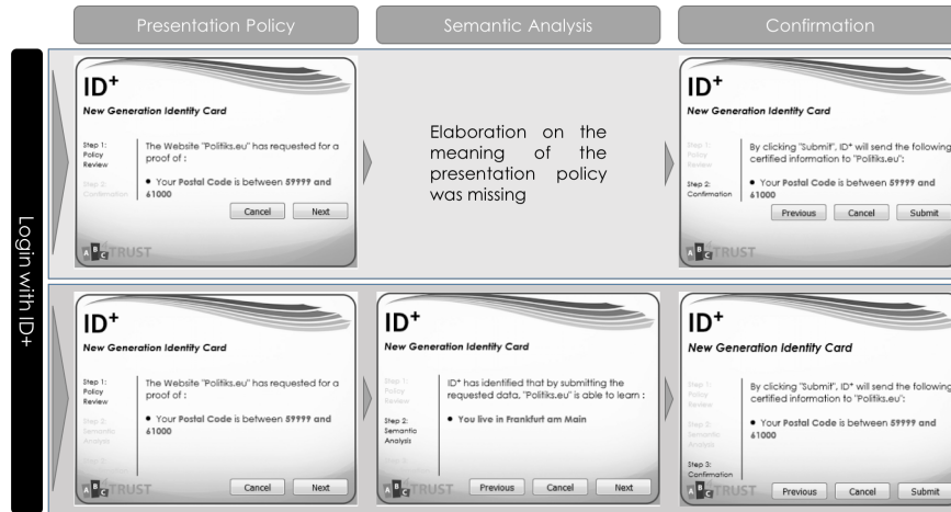
Fig. 2. Experiment Process