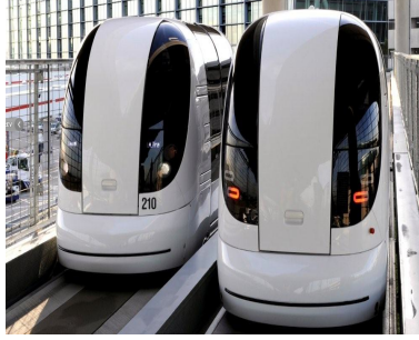
Fig. 1: ATN' vehicles 3

In this paper, we focus on the multi depot one-to-one PDP with distance constraints by studying its real world urban on-demand passengers transportation application. In fact, there is several transportation systems that are designed to move people in urban areas. Examples of these systems include subway, bus, train, bus rapid transit (BRT), light rapid transit (LRT), automated transit network (ATN) and so on.