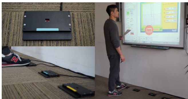
Fig. 1. FeetForward: a foot-based peripheral interface to support teachers' use of interactive whiteboards. See [14] for a demo video.

With the purpose of exploring how new classroom technologies can be designed to become peripheral and routine for secondary school teachers, this paper presents the research-through-design [12] study of FeetForward, a foot-based peripheral interface to facilitate secondary school teachers' use of interactive whiteboards (See Figure 1). We have deployed this simple yet new technology with three secondary school teachers in their classrooms for a period of five weeks. In this study, we used FeetForward as a technology probe [13] to gather implications for the design of peripheral classroom technologies. In particular, we aimed to study how FeetForward as a peripheral interaction design, could impact pedagogical activities, what may influence a new classroom technology to integrate into teacher's routines, and whether foot-based interaction styles were suitable for peripheral interaction.