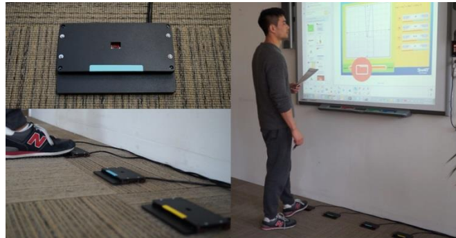
Fig. 1. FeetForward: a foot-based peripheral interface to support teachers' use of interactive whiteboards. See [14] for a demo video.

With the purpose of exploring how new classroom technologies can be designed to become peripheral and routine for secondary school teachers, this paper presents the research-through-design [12] study of FeetForward, a foot-based peripheral interface to facilitate secondary school teachers' use of interactive whiteboards (See Figure 1). We have deployed this simple yet new technology with three secondary school teachers in their classrooms for a period of five weeks. In this study, we used FeetForward as a technology probe [13] to gather implications for the design of peripheral classroom technologies. In particular, we aimed to study how FeetForward as a peripheral interaction design, could impact pedagogical activities, what may influence a new classroom technology to integrate into teacher's routines, and whether foot-based interaction styles were suitable for peripheral interaction.