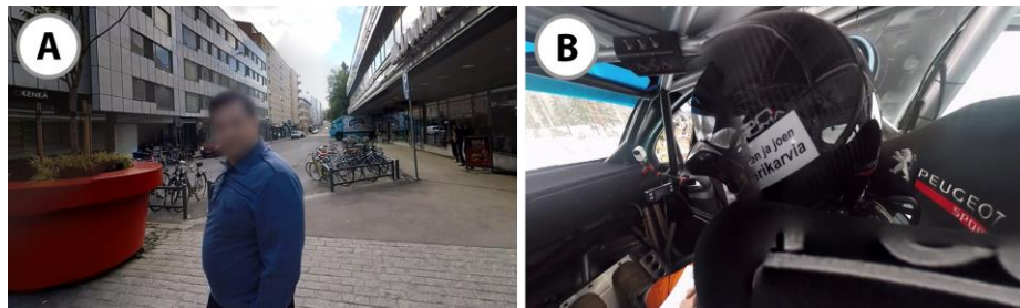
Figure 3. Examples of disrupting objects. A: A man looking straight at the camera as he is passing by. B: The navigator’s seat in the rally simulator.

Another example is the rally simulator, as the space inside the car was very cramped, and offered limited options for attaching the camera. Moreover, rules and regulations applied for filming inside rally cars, for instance, the camera was not allowed to reach into the front seat area, and had to remain further back. To get a good view of the windshield and the road ahead, however, we put the camera roughly between the two front seats (Figure 2B). While the primary goal was reached with a good view of the cockpit and the road, the front seats ended up being somewhat disturbing as they seemed to be unnaturally close to the viewport when users were looking around in the car with a HMD (Figure 3B).