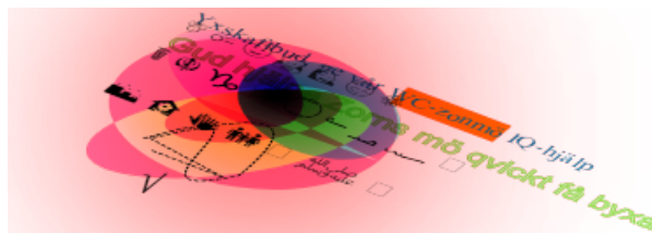
Figure 2: Example of a rendered picture following the canvas fingerprinting test instructions.

the browser to use one of its fallback fonts by asking for a font with a fake name. Depending on the OS and the fonts installed on the device, fallback fonts may differ from one user to another. For the second line, the browser is asked to use the Arial font that is common in many operating systems. Then, we ask for additional strings with symbols and emojis. All strings, with the addition of a rectangle are drawn with a specific rotation. A second set of elements is rendered with four mathematical functions: a sine, a cosine and two linear functions. These functions are plotted on a specific interval and using the PI value of the JavaScript Math library as a parameter. The third set of elements consists in drawing a set of ellipses. These figures are drawn with different colors and with different levels of transparency. Since filters for opacity change among browsers, it creates differences between them. The last element is a centered shadow that overlaps the canvas element. Figure 2 displays an example of a canvas rendering following the instructions of our script.