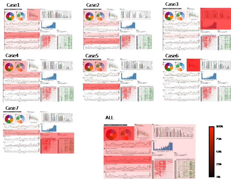
Fig. 3. A heat-map representing the coverage of graph-usage in each case. ALL shows the coverage by summing up all seven cases

Based on the results of the qualitative analysis of seven cases, we created a heat-map to visualize the coverage of used graphs on the dashboard. The heat-map is shown in Fig 3. In the figure, the used graphs in the discussion of each case are highlighted in transparent red.