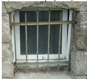
Fig. 3. A window protection with two types of bars

Challenge 3: At the wall there are several objects with the structure (0, 1, 0, 0, 1, 0). What is the purpose of these objects?