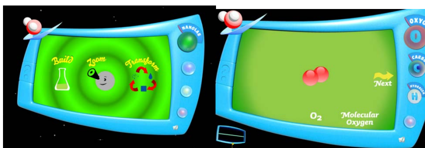
Fig 2 Molecularium Kidsite Nanolab screen and example O 2

interact with numerous examples of chemical concepts at all three levels of chemical thinking, that is, the molecular, symbolic and macroscopic. The chemical conceptual categories of molecules and atoms, and their interrelationships, based on the proposition that 'molecules are built from atoms', are instantiated in the playing.