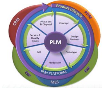
Figure 1. PLM Defining Elements