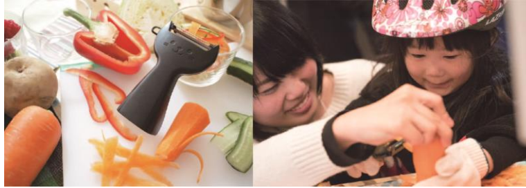
Fig. 1. Overview of TamaPeeler: Left) TamaPeeler, Right) Appearance in experience