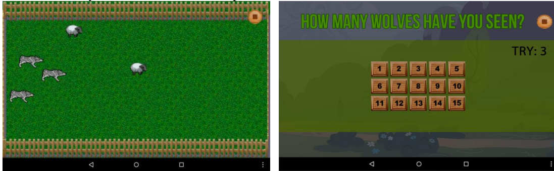
Fig. 1. The Counting Sheep Game Challenge and Response Interface.

Sheep and/or Wolves in the Enclosure; 2) Sheep and/or Wolves will be moving; 3) After one second, the player will have to answer with the number of Sheep and/or Wolves in the enclosure; 4) The player will be asked randomly about the number of Wolves; 5) In case the answer about the number of Wolves is not correct the player will not be penalized; 6) If the player provides a correct answer the difficulty level of the game will rise; 7) If the player gives a wrong answer, the difficulty level of the game will be reduced and the player can only miss two more times, i.e., the player will only be entitled to three attempts.