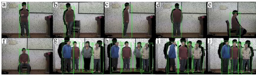
Fig. 3. pedestrian detection results: a. single scene(stand, front); b. single scene(stand, front); c. single scene(stand, side); d. single scene(stand, back); e. single scene(sit down, side); f. single scene(sit down, front); g. multi person scene(no occlusion); h. multi person scene(no occlusion); i. multi person scene(occlusion); j. multi person scene(occlusion).

Experiments were carried out on 382 pairs of images containing 1201 human bodies, and the detection rate achieves an average performance of 97.75%. The experiment is divided into two types: single scene and multi person scene. The experimental results show that the pedestrian detection algorithm based on RGB-D has good detection results even in the circumstance when the pose of pedestrian is changeable in single scene. The multi person scene is divided into two cases: with occlusion and without occlusion. The algorithm has good performance in both cases. Some experimental results are shown in Fig.3.