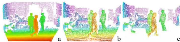
Fig. 2. Point cloud grid: a. the initial point cloud; b. point cloud after grid and down-sampling; c. point cloud after ground segmentation

We make a hypothesis that people walk on the ground in this paper. The ground plane is estimated by several points marked in advance on the ground plane. According to the estimated ground plane, we can remove the corresponding voxel point cloud, and further reduce the irrelevant data. The RANSAC segmentation algorithm is adopted to design a model for segmentation judging, and the input data is iteratively extracted by the judgment criterion. First, set thresholds for all points of the point cloud dataset, and randomly select points from the grid point cloud data and calculate the parameters of the given judgment model. If the distance between the point and the determining model is smaller than the threshold, then the point is internal, otherwise it is external out of points. The external points will be removed. As shown in Fig. 2c, the voxels of the ground plane are removed and the volume of the target image is greatly reduced.