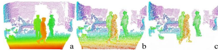
Fig. 2. Point cloud grid: a. the initial point cloud; b. point cloud after grid and down-sampling; c. point cloud after ground segmentation

We make a hypothesis that people walk on the ground in this paper. The ground plane is estimated by several points marked in advance on the ground plane. According to the estimated ground plane, we can remove the corresponding voxel point cloud, and further reduce the irrelevant data. The RANSAC segmentation algorithm is adopted to design a model for segmentation judging, and the input data is iteratively extracted by the judgment criterion. First, set thresholds for all points of the point cloud dataset, and randomly select points from the grid point cloud data and calculate the parameters of the given judgment model. If the distance between the point and the determining model is smaller than the threshold, then the point is internal, otherwise it is external out of points. The external points will be removed. As shown in Fig. 2c, the voxels of the ground plane are removed and the volume of the target image is greatly reduced.