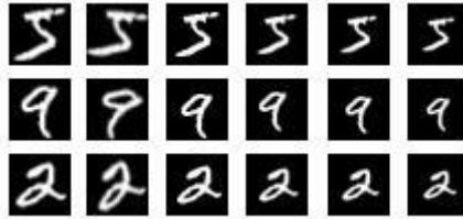
Fig. 2. Part of the New MNIST test images

Because of the MNIST data have relatively simple characteristics. Here divide the MNIST test set into six parts randomly, each part is transformed into different scales or angles, and then normalize the images in 28*28 pixels to get a new test set. The training set remains the same. Test on data sets MNIST, New MNIST.