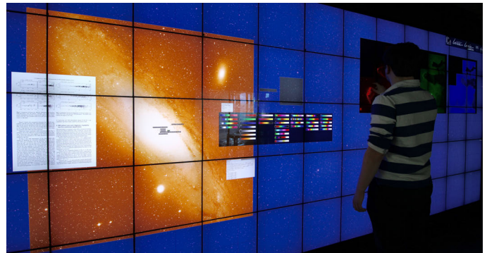
Figure 2. FITS-OW on WILDER showing multiple FITS images, the result-set of a SIMBAD query restricted to observations about galaxies, basic measurements for galaxy M31, a page of a research paper discussing that particular galaxy, and the color map selector.