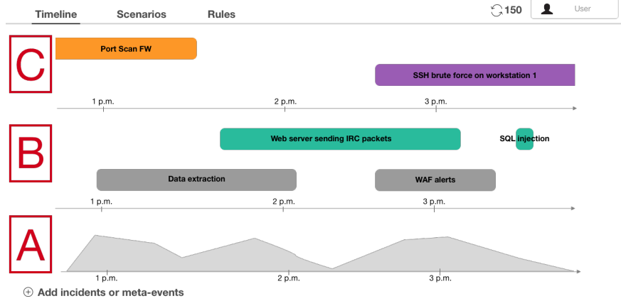
Fig. 2. Timeline view.

situational awareness, and the scenarios and rules views are dedicated to these types of data. The different views are accessible to all analysts while modifying data is limited to Tier 2 analysts.