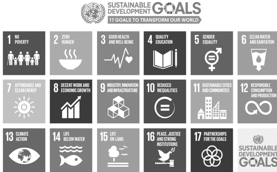
Fig. 2. United Nations Sustainable Development Goals

ICTs are seen as central to achieving the Sustainable Development Goals (SDGs) and are specifically mentioned in Goals 4, 5, 9, and 17 and their targets or indicators (see Table 1).