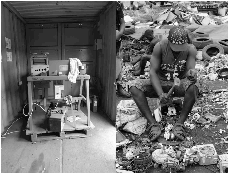
Fig. 3. Cable stripping machine (left) and electronics recycling (right) in the Agbogbloshie scrap metal yard

Meet Agbogbloshie, a large scrap metal yard in Accra, Ghana, where I implemented fieldwork on repair and recycling as part of my research on the life cycle of mobile phones. Agbogbloshie is the place where cars, machines, and condemned electronics, such as mobile phones, are recycled. Non-metals parts that cannot be recycled, remain behind as untreated waste or are used as ‘fuel’ for the burning of cables that contain copper.