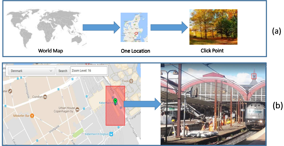
Fig. 3. (a) The steps on how to create a CPMMap password, and (b) an example: selection of one location on a world map in the first step and selection of one point on an image in the second step.