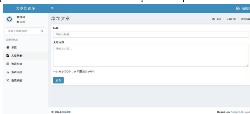
Figure 1 a The window for adding articles is the man-machine interface

The first step is to enter the "Add Article" interface we provide ( http://kb2.sloud.cn/article/add )