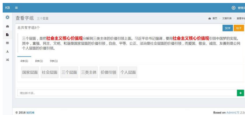
Figure 3 shows an example of a three-level knowledge module

As shown in Figure 2, the essence of two centuries is highlighted or expressed or understood even more through a series of word combinations that are related, similar or similar to each other. The most crucial is the human-computer interaction process. In terms of individuals and groups, human-computer interaction can be easily achieved, and even human-computer interaction and interpersonal networking can be achieved. The combination of such intellectual activities and artificial intelligence is far more than simply reading texts, even graffiti discussions on paper or chalkboard, and is more flexible and easier to retain, share, and have standard measurability. Readers can compare themselves ( http://kb2.sloud.cn/article/219/group ) 。