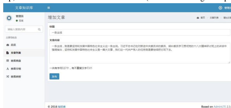
Figure 1 b Fill in or import the text of "Title" and "Article Content" in the window of the increase article

The second step, fill in the "Article Content" and "Title" (see the following example)