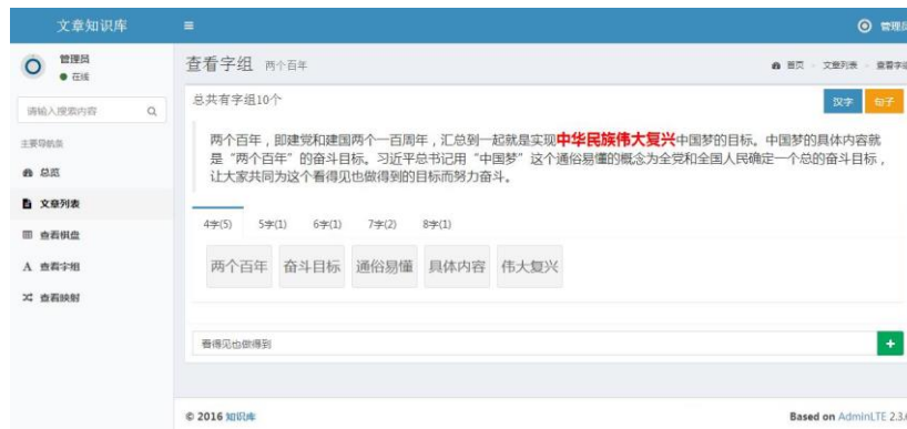
Figure 2 "Two hundred years" example of knowledge module diagram

As shown in Figure 2, the essence of two centuries is highlighted or expressed or understood even more through a series of word combinations that are related, similar or similar to each other. The most crucial is the human-computer interaction process. In terms of individuals and groups, human-computer interaction can be easily achieved, and even human-computer interaction and interpersonal networking can be achieved. The combination of such intellectual activities and artificial intelligence is far more than simply reading texts, even graffiti discussions on paper or chalkboard, and is more flexible and easier to retain, share, and have standard measurability. Readers can compare themselves ( http://kb2.sloud.cn/article/219/group ) 。