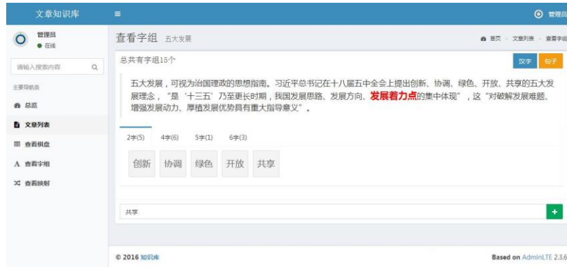
Figure 5 shows an example of a "five developments" knowledge module

This is more meaningful than simply staying in these words. Ask the reader to try and compare.