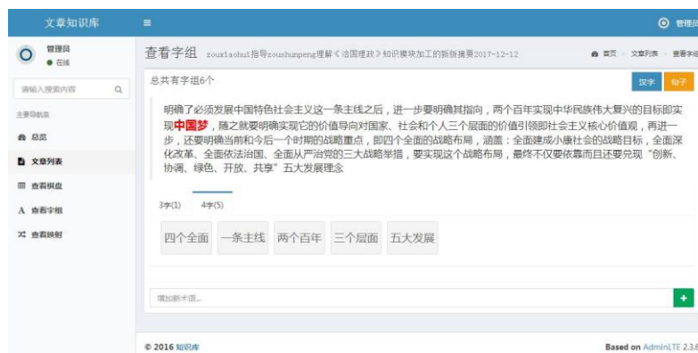
Figure 7 Summary of the General Knowledge Module in "Governing the State"

The specific practices and steps are as follows: