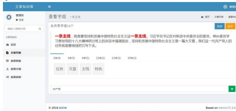
Figure 1 "One main line" example of knowledge module diagram

This will further systematize Xi Jinping's idea of ruling the state, so that further formation of a universal scientific theory system through computer-aided research is helpful. For the time being, it is not necessary to construct an expert knowledge system for human-computer interaction that requires a human-computer interaction native language environment that is compatible with personalization and standardization. Only a set of specific and operable embodiments is cut in.