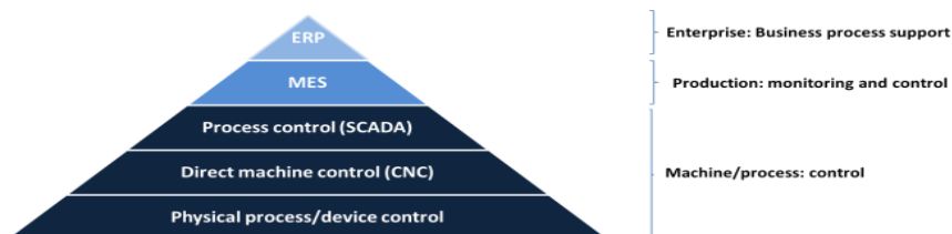
Fig. 1. Automation pyramid

The automation pyramid classifies industrial systems into distinct layers as can be seen in Figure 1 [4, 11]. On the uppermost level, ERP takes on the role of the transactional backbone of all business processes and databases of a company [12].