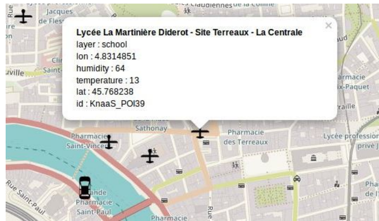
Fig. 3. Visualization of POIs with better environmental conditions.

fusion between the knowledge graphs of OpenStreetMap and Wikidata was the common way of representing the geo-coordinates information.