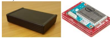
Figure 1 Edge Service Deployment Methods

service to independently manage itself, its communication and the analytical tasks it performs, based on characteristics that are specified within the semantic model. The system is broken down into two layers, core and edge. The core components operate over the entire urban water system and are generally hosted and operated centrally by water network operators. The edge components consist of a series of cognitive edge services, each of which is located at distributed locations within the water network and is responsible for managing aspects of the water network in that local area. Physically these edge services can be deployed on a variety of hardware from standard desktop computers, to custom made gateway boxes (left of Figure 1) to small integrated controllers (right of Figure 1).