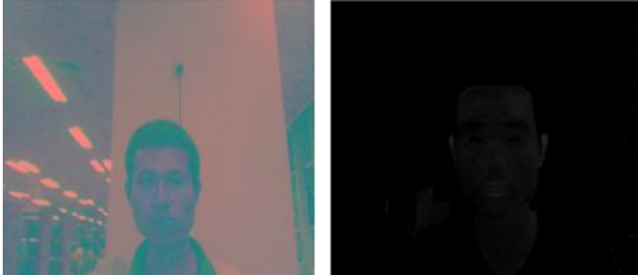
Fig. 1. NTSC brightness image(face)

The experimental image set has a total of 200 pairs, and is represented by experiments in both face and gesture. After detecting the NTSC image, one of the images is taken as the luminance frame. The image results are shown in Figure 1 and Figure 2.