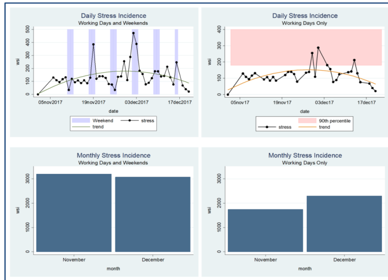
Fig. 2. Stress measurement on organizational with the Weighted Stress Incidence (WSI)

the device during leisure time). From the focus group discussion, we know that there has been a special occasion which required some administrators to work over weekends which could explain the higher stress levels). Overall November and December are equivalent in terms of WSI at organizational level.