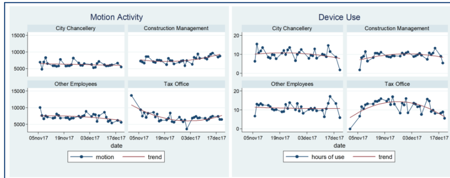
Fig. 4. Device use and motion activity during working days