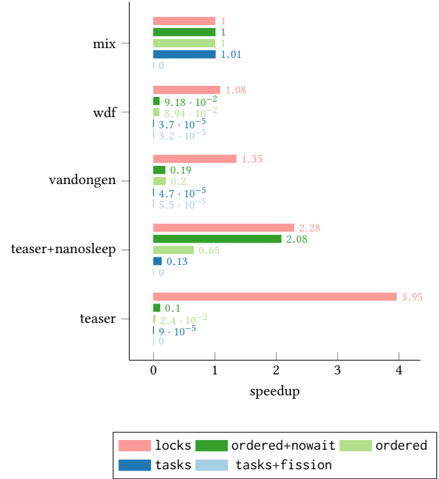
Figure 5. Speedups or slowdowns over sequential version N = 100,000 for teaser, wdf, van_dongen N = 3000 and M = 3000 for mix clang 9.0.0, options: -O3 -march=native -fopenmp

Manual blocking and locks outperform the ordered+nowait versions and even allows our teaser example to exhibit speedups without the call to nanosleep. The results show the speedups for block sizes similar to the default chunk size for non blocked versions. We have observed even greater speedups with different block sizes (for instance a speedup of