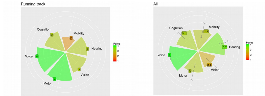
Fig. 2: Example assessment of the exhibit “Running track” (left), and mean and standard deviation of the accessibility indicators for all evaluated exhibits (right)

ations where pupils argued about the “ownership” of numbers, and sometimes they were unable to say who had won, because they were not capable of comparing two given numbers. Also, the correct understanding of the unit “km/h” cannot be expected by pupils in the lower ages (C).