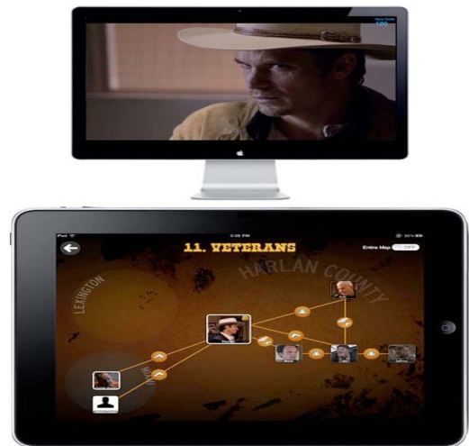
Figure 2. Story-Map's character map with the broadcast programme in the background [11]

Characters who were mentioned but who had yet to appear were greyed. Characters who had appeared but were not currently present were indicated by a reduced size icon. Rather than showing who is literally visible in the frame, the map showed who was present in the semantic dramatic unit. Characters were also grouped according to geographical location and were iconified, providing access to a brief biography which was updated with the narrative. No evaluation trials with Story-Map have been reported.