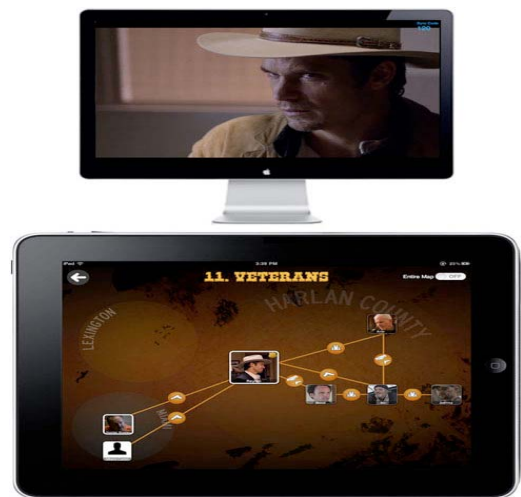
Figure 2. Story-Map's character map with the broadcast programme in the background [11]

Characters who were mentioned but who had yet to appear were greyed. Characters who had appeared but were not currently present were indicated by a reduced size icon. Rather than showing who is literally visible in the frame, the map showed who was present in the semantic dramatic unit. Characters were also grouped according to geographical location and were iconified, providing access to a brief biography which was updated with the narrative. No evaluation trials with Story-Map have been reported.