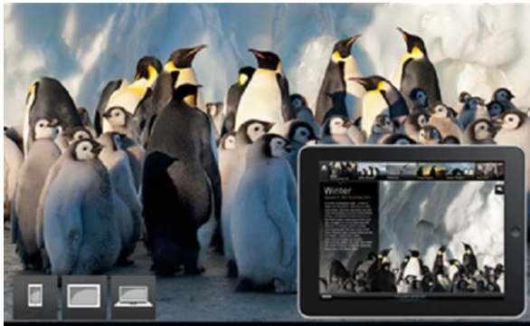
Figure 1. Frozen Planet companion second screen [1].

representational functions required of second screens for science programmes. The first exemplar is the second screen developed for an episode of Frozen Planet [1]. This app pushed content to the viewer in synchrony with the programme; with each animal introduced in the programme, a thumbnail image/ icon appeared in the app, giving access to a summary of facts about the animal which could be bookmarked.