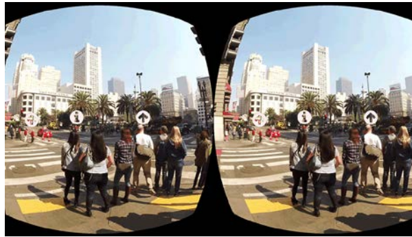
Figure 2. Screenshot from the CityCompass VR application. The application is divided into two viewports.

The application has two types of user interface elements: exits and hotspots . Exits transition both users to the next scene, and hotspots provide contextual information about the environment. These interface elements are activated with a dwell-timer, i.e. the user has to focus on the desired element for pre-defined time in order to activate it.