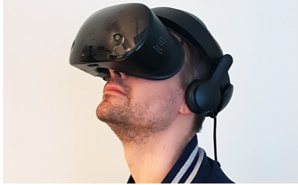
Figure 1. HMD device with an integrated headset.

User Interface and Interaction. In CityCompass VR, the users can freely explore the ODV content by turning their head to the desired direction. The screen is divided into two viewports, thus creating the illusion of a stereoscopy and a sense of depth to the user. Both users have their own HMD (Figure 1) devices and have their own individual views of the application (see Figure 2).