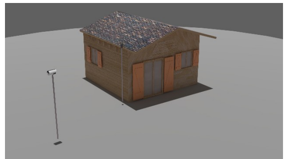
Fig. 1: 3D scene involving a wood house and an infrared camera that can be loaded by the software.

Where V_{kj} represents the visibility between the element k and element j , F_{k \rightarrow j} is the form factor that characterizes the exchange between the surface k and j and \epsilon_{k,\Delta\lambda_i} is the emissivity of the surface k in the band \Delta\lambda_i . The progressive radiosity algorithm has been implemented in C++ by taking advantage of the latest graphical libraries and parallelized through a GPGPU (General-purpose processing on graphics processing units) approach.