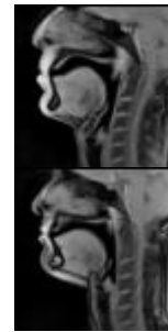
Silence frames. Top: train frame and Bottom: test frame