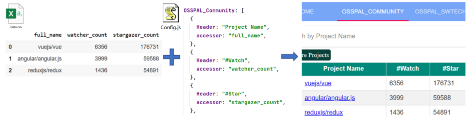
Fig. 2. An example of Configuration File

The crawled data is saved locally in A comma-separated values (CSV) file with each row containing the values of an individual OSS candidate. To be noted, the required data can be selectively crawled according to the users, who determine which metrics are the important ones when evaluating particular aspects of OSS. Such selection of data can be guided by the evaluation model chosen by the evaluator. For example, when selecting only the most popular OSS, the numbers of stars, watches, and download are the ones to be crawled.