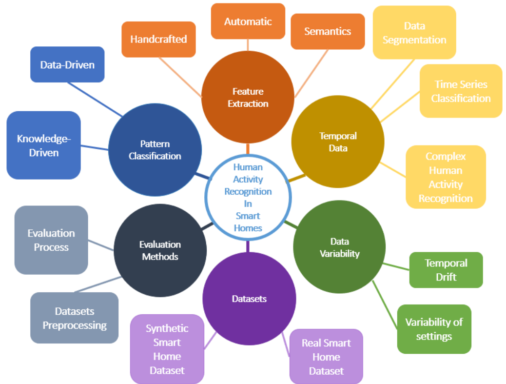
Figure 2. Challenges for Human Activity Recognition in Smart Homes

Many methods have been used for the recognition of human activity. However, this field still faces many technical challenges. Some of these challenges are common to other areas of pattern recognition (sec. 2) and more recently on automatic features extraction algorithms (sec. 3), such as computer vision and natural language processing, while some are specific to sensor-based activity recognition, and some are even more specific to the smart home domain. This field requires specific methods for real-life applications. The data have a specific temporal structure (sec. 4) that needs to be tackled, and poses challenges in terms of data variability (sec. 5) and availability of datasets (sec. 6) but also specific evaluation methods (sec. 7). The challenges are summarised in fig. 2)