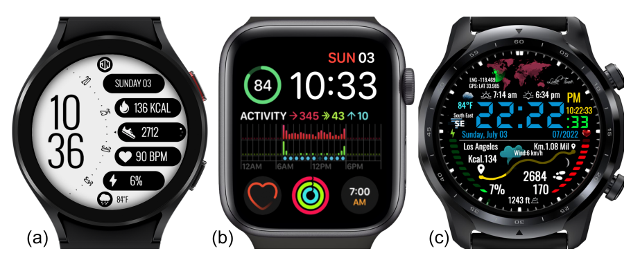
Figure 2: Example of sports smartwatch faces. Watch face design by: a) JN-Rolling (JN-WatchFaces), b) New Design (Enid Rodriguez), and c) Voyager GPS-01RB Sport 24H (Luke Time) from Facer App [45].