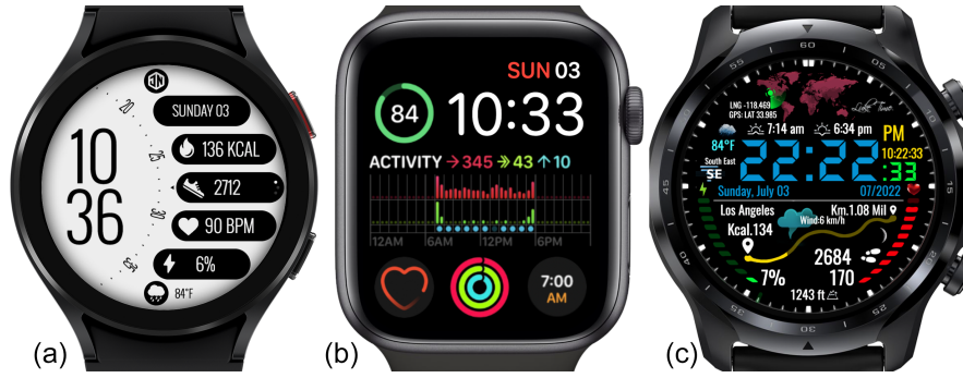
Figure 2: Example of sports smartwatch faces. Watch face design by: a) JN-Rolling (JN-WatchFaces), b) New Design (Enid Rodriguez), and c) Voyager GPS-01RB Sport 24H (Luke Time) from Facer App [45].