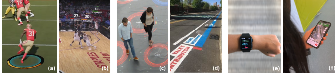
Moving visualization & stationary viewer. Stationary visualization & moving viewer. Moving visualization & moving viewer.