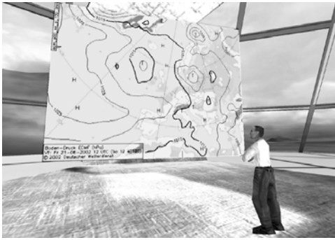
Figure 2. A newspaper reader reads the forecast.

The virtual newspaper world is modelled in a way that allows for an intuitive navigation and enables the user to quickly and easily access those news feeds that are of particular interest to him. The graphical user interface allows for visualization and enrichment of news by means of three dimensional objects.