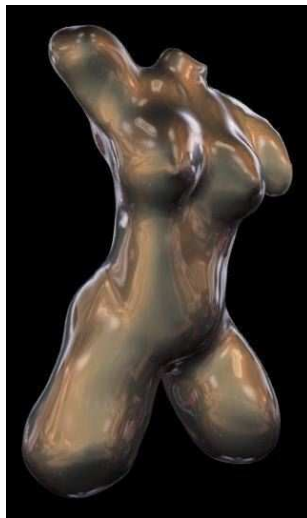
Figure 1: An artwork modeled with a virtual sculpture application. This sculpture was achieved without haptic feedback within 4 hours. (Illustration extracted from [6])

This paper proposes an effective solution to the incorporation of expressive haptic feedback in a volumetric sculpting system, together with a simple solution for reducing the instability problems during the interaction. As our results show, our new haptic rendering improves interactivity and immersion, thus making the sculpting system far easier to use.