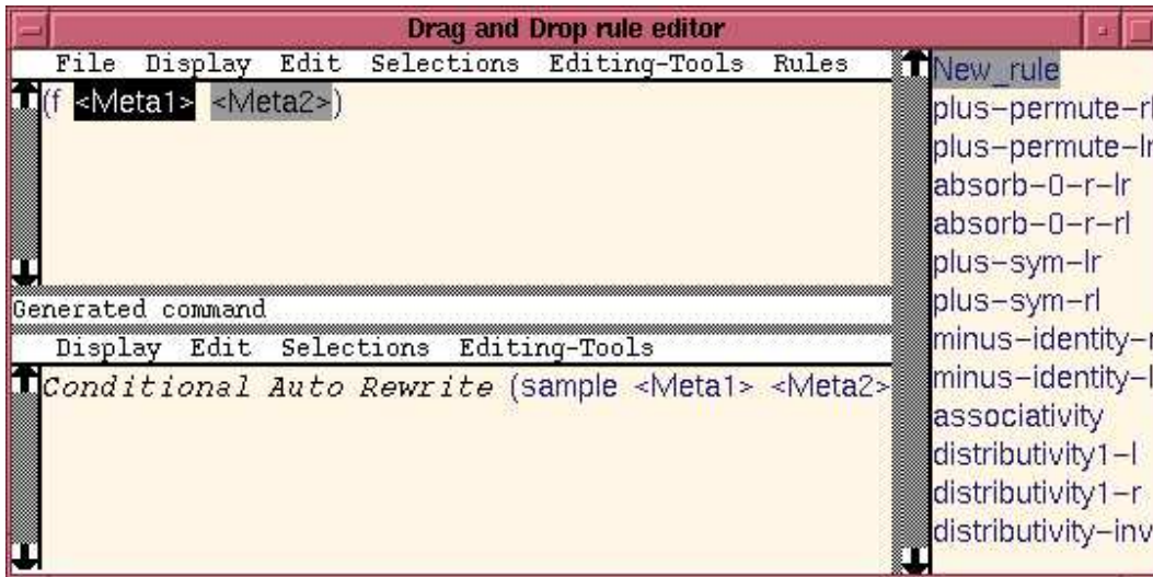
Figure 4: The drag-and-drop rule editor. The top left window contains the formula pattern and indicates the start and end positions. The bottom left window contains the triggered rewrite command. The right window shows the ordered list of rules.