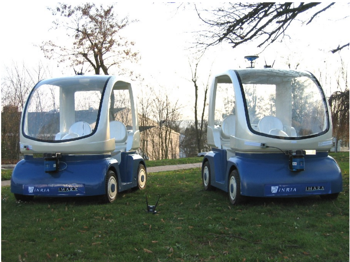
Figure 2: The CyCab vehicles