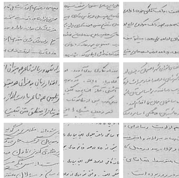
Figure 4. Samples of handwriting from different participants

For evaluation of our proposed method, we selected 25 participants with respect to age, gender, education, etc. and asked from each participant to copy out a desired text in his/her natural handwriting on an A4 page. Handwritten documents are digitally scanned at 300 dpi resolution and preprocessing is performed for those documents. Each preprocessed image is divided into 4 non-overlapping blocks, and 3 blocks is considered for training and one block for the testing. Fig. 4 shows samples of handwriting from different participants. The performance of the five described methods for feature extraction was investigated and results are given in the following.