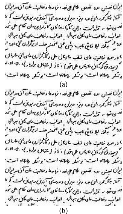
Figure 2. (a) Space between words and lines is normalized and the padding is done for each line of text, (b) the final preprocessed image