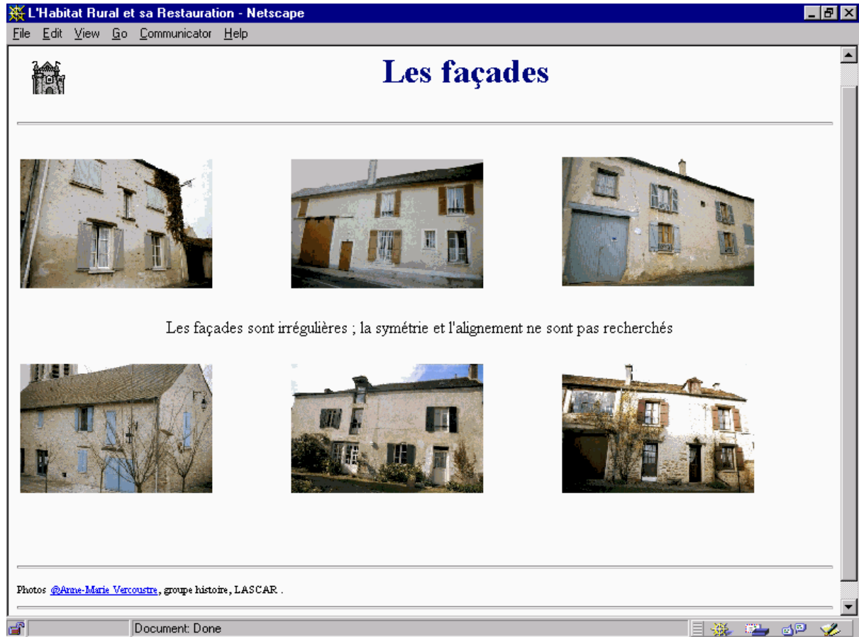
Figure 2: Example of photos

Examples of photos can be seen in Figure 2 .