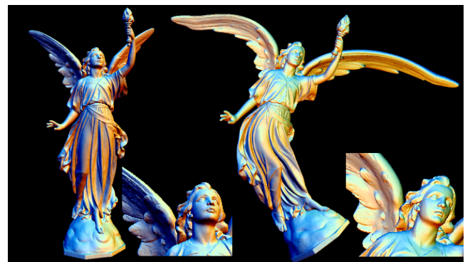
Figure 2: The interactive smooth deformation of this model (28M triangles) has been done in less than 5 minutes, including pre and post streaming process, with our system.