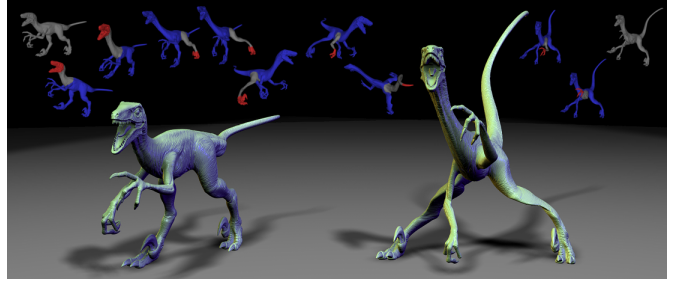
Figure 1: Left: Our FFD system with two out-of-core bracketing steps. Right: Interactive FFD on the Raptor (8M triangles.)